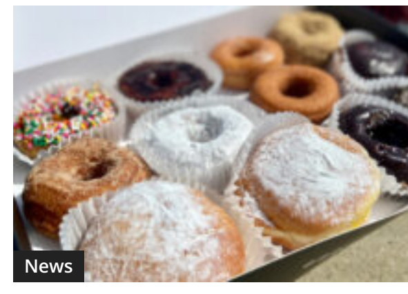
Neighbor's complaints puts pressure on Back Door Donuts