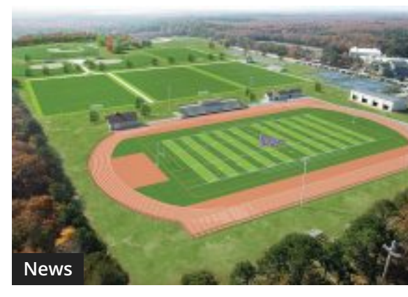
School committee using private donations to fund turf lawsuit