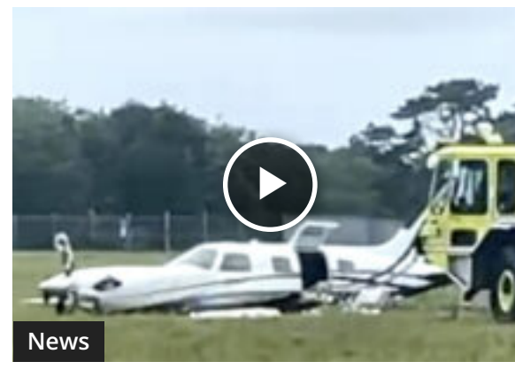
Pilot involved in Vineyard plane crash dies