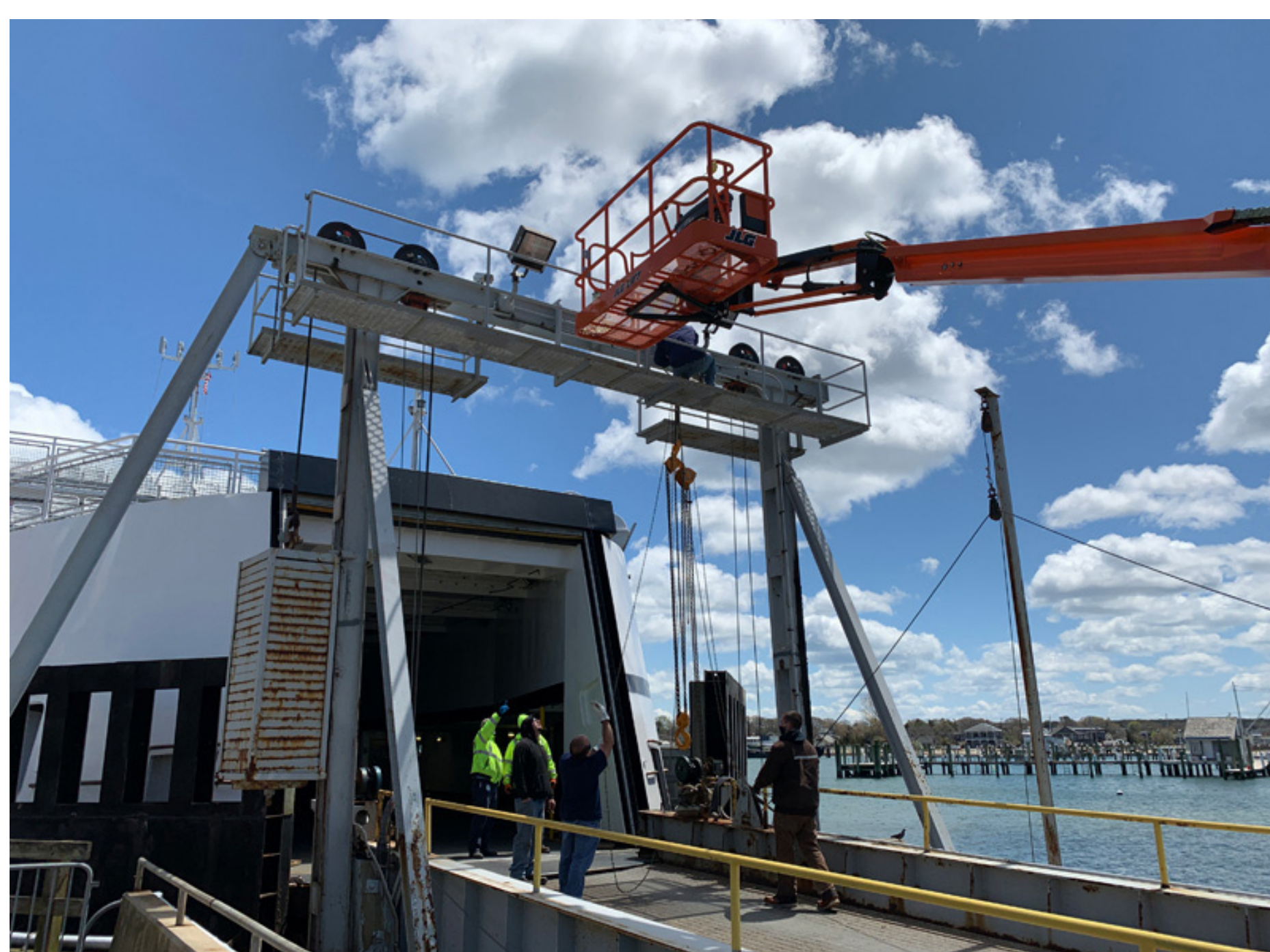
Steamship Authority maintenance and terminal personnel work on May 9, 2020 to repair the Slip 1 transfer bridge in Vineyard Haven after a cable snapped and sent a set of counterweights into Vineyard Haven Harbor.